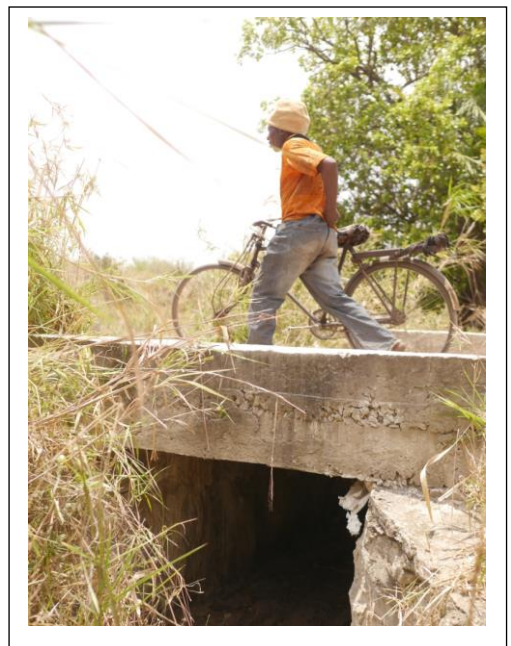
Culvert constructed during the training in 2013

Another point to be noted here is that not all villages who sent their representatives to the same training succeeded in utilizing the gained know-how in their village like Matema Village did. What was Matema's