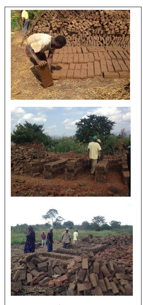
of Mtoni hamlet People working on their obligations at the site of Brick Bank

by the community of Libenanga through good management of the construction committee. In addition to this, there are some other secrets of the success besides strong commitment of the community.