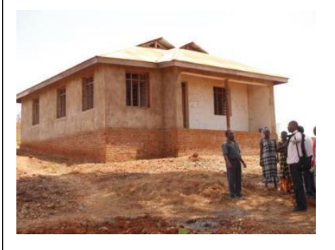
Village office almost completed as of October 2016.

Villagers clearing the space around the office to make a path.