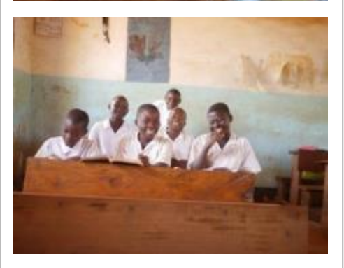
Pupils are so happy to study with new desks

classrooms spending <u>Tsh 15,477,000</u>. The money given by CDTF was very helpful and well <u>managed so the remaining amount after completing two</u> classrooms was used to construct 2 pit latrines for the teachers. In this way, <u>the village succeeded to collaborate not only with the District Council but also with an NGO based on their strong initiatives</u>.