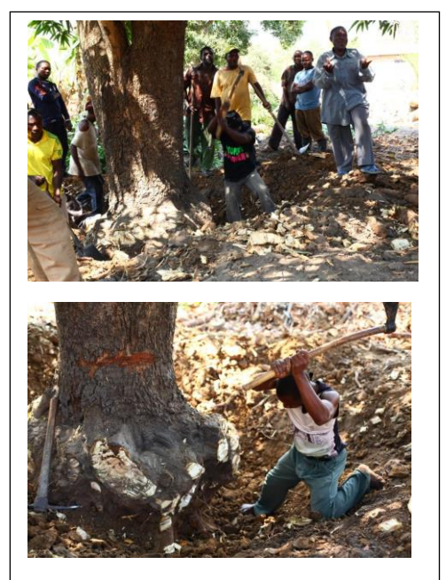
Clearing land for road construction in 2016

kitongoji meeting is reported to Village Council through the road construction committee.