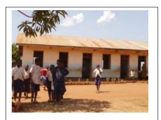
The second two classrooms built in 2009

In the year 2006, through a collaboration between the community initiative and District Council, Libenanga Primary School was launched with 2 class rooms, a teacher's house and 2 pit latrines.