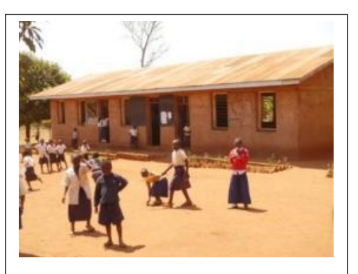
The first two classrooms built in 2006

bricks. They collected money, sand and stones from each household. They formed a construction committee and set specific targets as a starting point to construct two classrooms and one teacher house by themselves. The process of construction work was also implemented by the community based on divided roles and time schedule utilizing bricks, money, sand and stones they collected. <u>The community's</u> <u>financial and material contribution together</u> with their labor force amounted to Tsh <u>16,000,000 in total.</u>